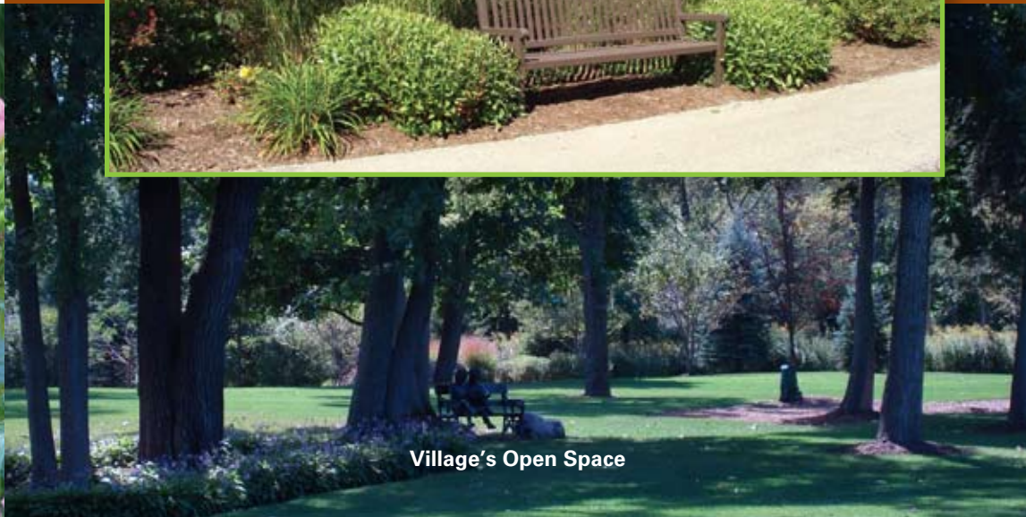
Village's Open Space

Conveniently located adjacent to Tri-State 294 Tollway, near I-94 Edens Expressway, and only 45 minutes from downtown Chicago, Bannockburn is a great place to work, dine, and shop.