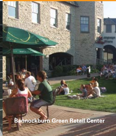
Bannockburn Green Retail Center