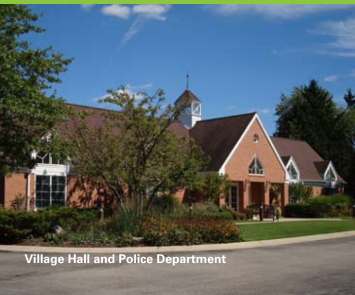
Village Hall and Police Department

Over the years more land was acquired and today the Village encompasses 2.5 square miles located approximately 26 miles north of Chicago and 4 miles west of Lake Michigan and 60 miles south of Milwaukee.